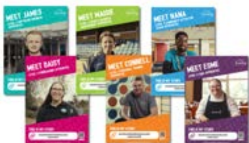
This is My Story film posters

As well as the display pack, there are a wide range of posters available on our website that you could use to create a display: